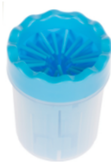
Hangzhou's Accused Product

28. Hangzhou is infringing the '126 Patent by making, selling, offering for sale, importing, and/or using an accused product with an overall design substantially similar to the overall design claimed in the '126 Patent. Infringement is occurring because an ordinary observer, giving such attention as a purchaser usually gives, would consider the two designs to be substantially the same in light of the prior art.