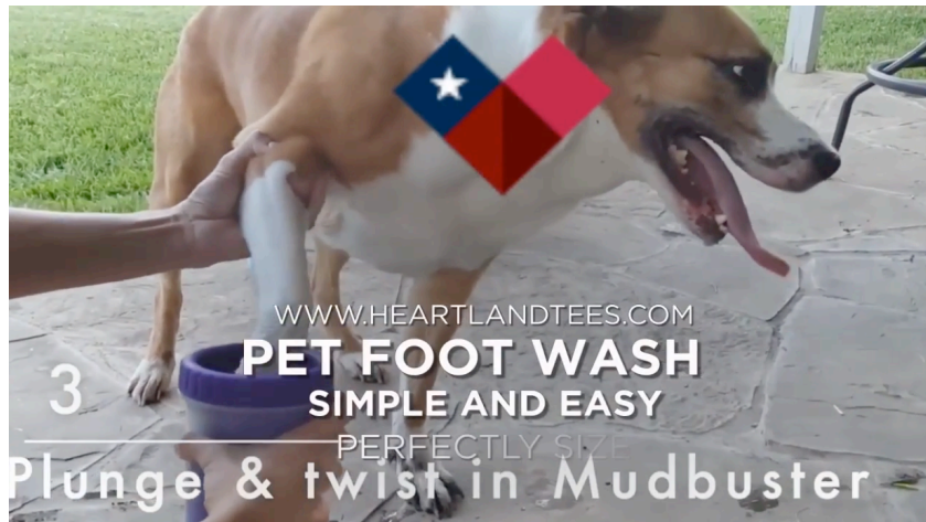
Image from Heartland Tees Advertising Video showing Dexas MUDBUSTER™ Product

19. An additional still image from the same Heartland Tees advertising video is set forth below and attached to this complaint as Exhibit 3 . This image depicts the Dexas MUDBUSTER™ product that contains the design claimed in the ‘126 Patent. It also shows the URL for Heartland Tees (www.heartlandtees.com) and the Dexas MUDBUSTER™ trademark.