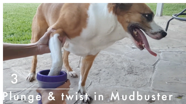
Dexas MUDBUSTER™ Video Image