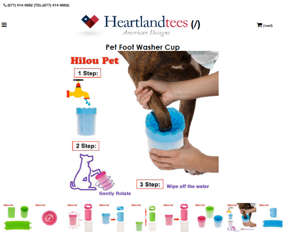
Heartland Tees Accused Product Advertising Image

An image from this Heartland Tees website shows both the Accused Product and the Dexas MUDBUSTER™ product. The image from the Heartland Tees website is set forth below and the full website page is attached to this complaint as Exhibit 5 .