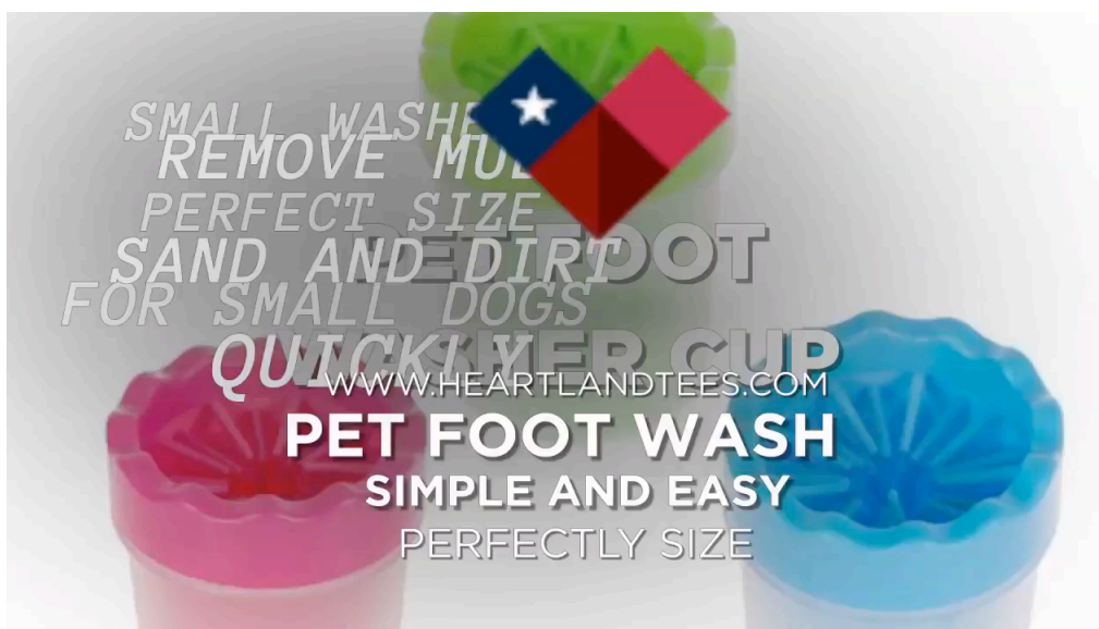
Image from Heartland Tees Advertising Video

showing the Accused Product is set forth below and attached to this complaint as Exhibit 2 .