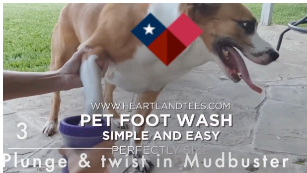
Heartland Tees Video Image

attached hereto as Exhibit 4 . The still image from the Heartland Tees video is shown below left and the still image from the Dexas MUDBUSTER™ video is shown below right.